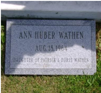
Separate in ground marker